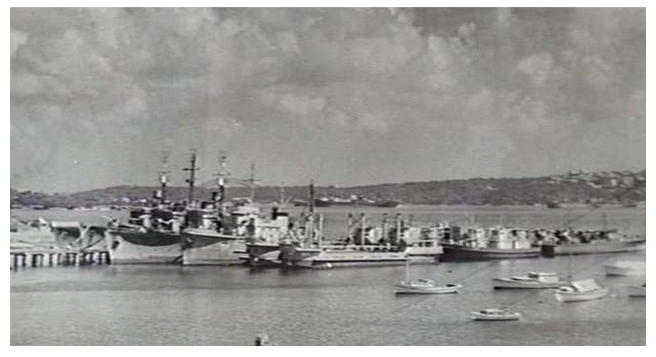
VILLAGE POINT, WATSON'S BAY, SYDNEY, NSW. C.1948. RAN SHIPS IN RESERVE.

23 November 1945 arrived in Sydney and moored alongside HMAS Glenelg at no.4 buoy. From 23rd to 30th November de-storing of ship occurred.