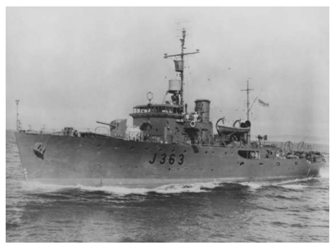
Strahan conducted escort and anti-submarine patrol duties in New Guinea after commissioning.

Following a period of trials, Strahan proceeded in May 1944 to the New Guinea area where she was employed on escort and anti-submarine patrol duties.