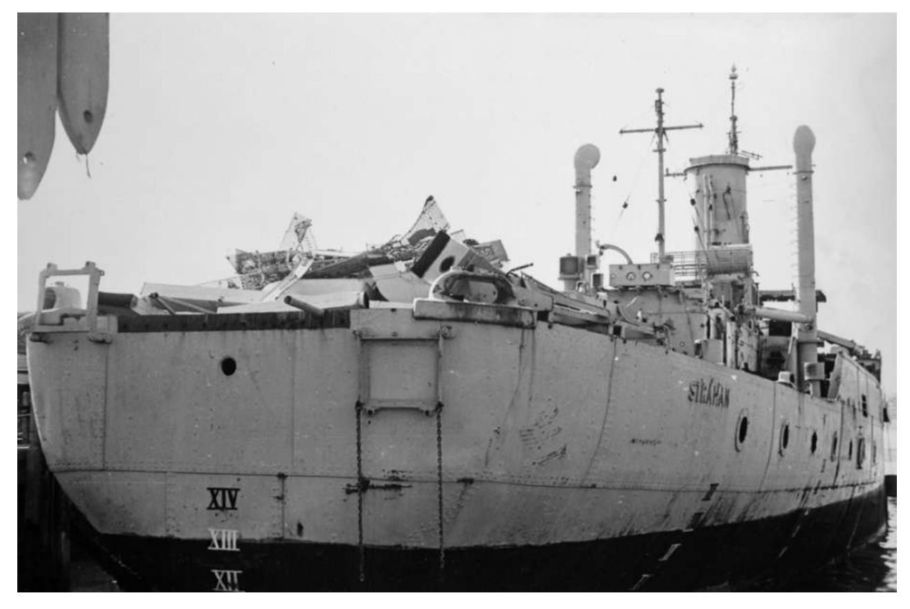
Strahan shortly before her final disposal in 1961.

THERE ARE PRESENT THE CORVETTES HMAS KAPUNDA (PROBABLY THE MIDDLE VESSEL), STRAHAN AND COLAC, THE TUG HMAS SPRIGHTLY (FOURTH FROM LEFT), THE MOTOR STORES LIGHTER MSL251 AND THE GENERAL PURPOSE VESSEL GPV963 (THESE LAST TWO IDENTIFIABLE BY THEIR NUMBERS). ALSO PRESENT ARE THE MOTOR WATER LIGHTER MWL256, THE GENERAL PURPOSE VESSELS STERNA (GPV952) AND TRINGA (GPV951), GPV953, GPV960, AND HMA MOTOR LAUNCHES ML801, ML805, ML810, ML822 AND ML825.