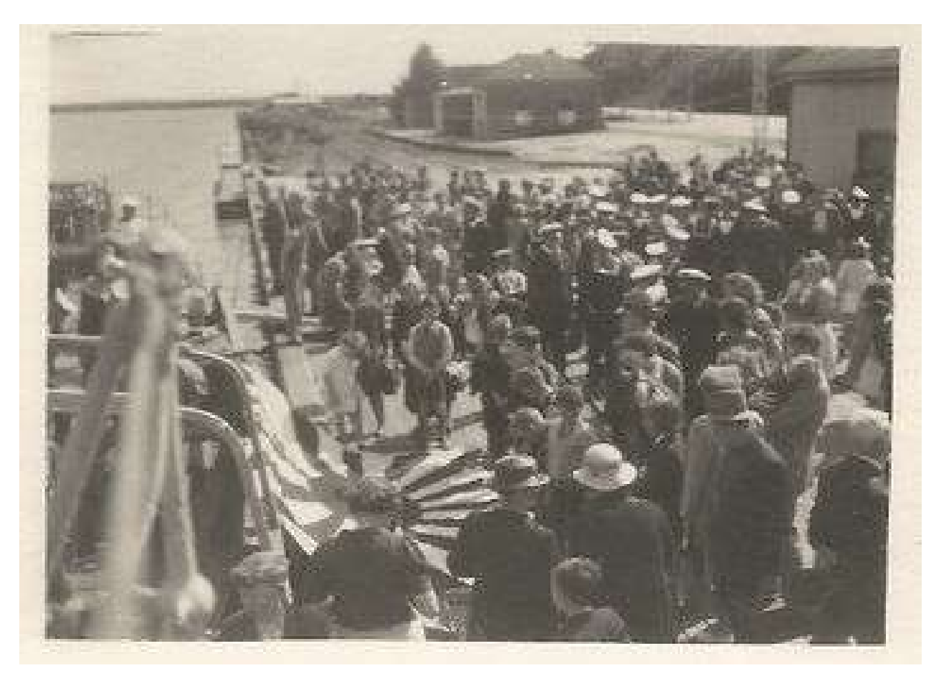
Presentation of captured Japanese flag to Strahan Municipal Council 19 November 1945

23 November 1945 arrived in Sydney and moored alongside HMAS Glenelg at no.4 buoy. From 23rd to 30th November de-storing of ship occurred.