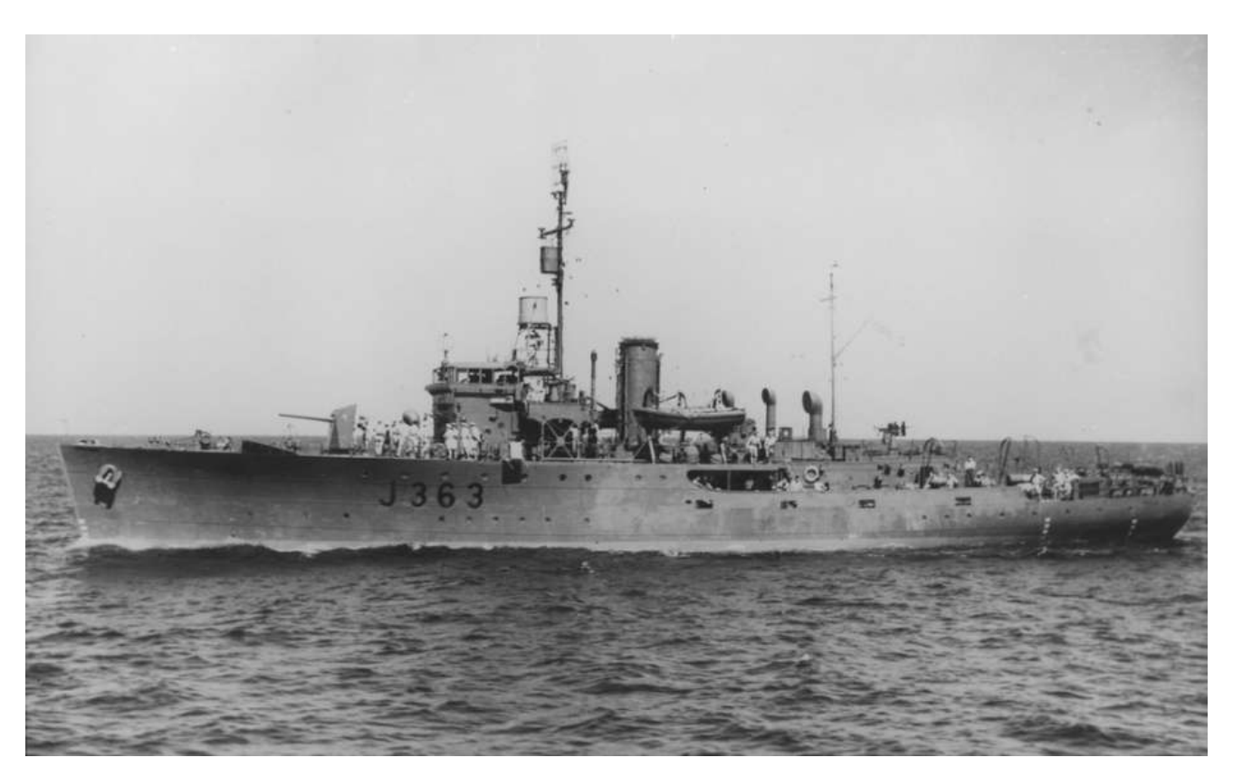
Strahan conducted post-war minesweeping duties.

While on anti-piracy patrol on 26 September a violent explosion occurred under the ship approximately under the Wardroom Flat. 7 Crew members were slightly injured. Engines and steering not in fit condition to Proceed. Requested a tow from HMAS Wagga and proceeded to Hong Kong. Wagga relieved of tow by HMRT Integrity. On arrival Hong Kong made fast alongside HMS Resource.