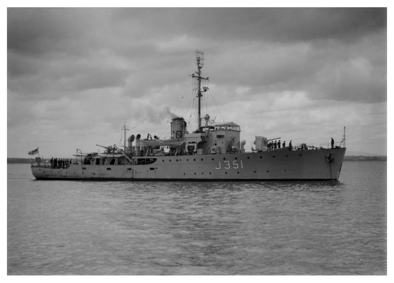
HMAS Cowra wearing the 'number 20' on her funnel signifying that she was a part of the 20th Minesweeping Flotilla.

In the post-war period Cowra joined the 20th Minesweeping Flotilla and took part in mine clearance operations on the east coast of Australia and off Hobart, New Britain and the Solomon Islands.