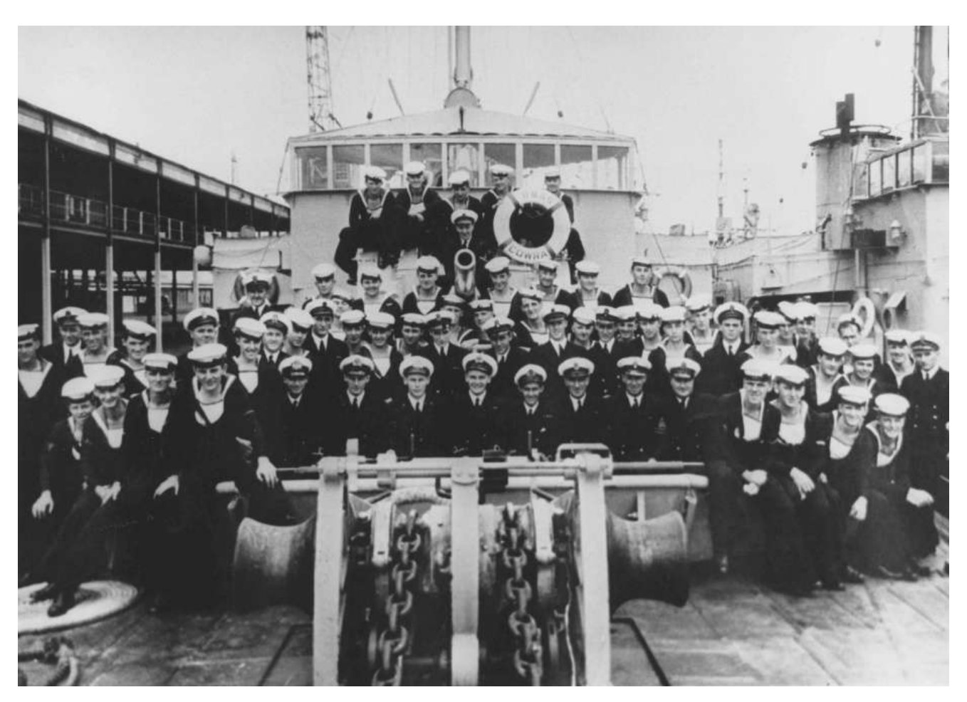
Ship's company of HMAS Cowra, circa 1951.

The ship remained in active seagoing commission until 15 May 1953 when she commenced paying off into dockyard control after steaming a further 50,000 miles, bringing her seagoing career to a close.