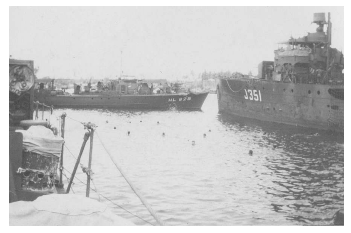
HMAS Cowra in company with ML325 during a lighter moment in waters off Madang when permission was given for 'hands to bathe'.

The early months of 1945 were spent operating, between Sorido and Mios-Woendi. Some relief from the monotony of routine patrolling was gained in January 1945 when she bombarded Japanese held positions at Yalela Bay in the Northern Halmaheras. On 17 July 1945 Cowra 's wartime service in the forward areas came to an end when she departed Langemak for Melbourne.