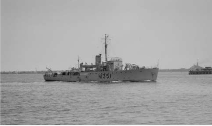
HMAS Cowra.